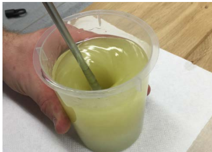
5. Mix with wing stirrer thoroughly for 1 minute until material is homogeneous