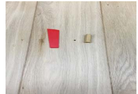
8. Close drill hole with commonly used materials

The variety of materials used and the different construction site conditions, which lie beyond our control, preclude any claims based on this data. We therefore recommend making sufficient trials. Accompanying recommendations and regulations, flooring manufacturer's instructions and the currently applicable codes must be observed. Please observe our usage advices in the Technical Information of our products. We gladly provide technical advice and written installing recommendations for concrete job sites. This recommendation supersedes all previous versions.