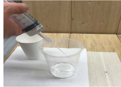
3. Put 25 ml of water (enough for 300 ml WAKOL MS 335 Repair Resin) with the syringe into the measuring cup