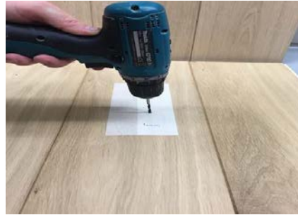
2. Open hollow spot by drilling, if necessary make additional drillings