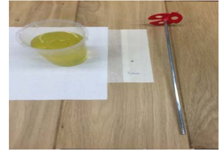
4. Add 300 ml of WAKOL MS 335 Repair Resin to the cup