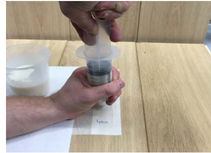
7. Press mixture into the hollow spot. Continue until hollow spot is entirely filled. Weigh down filled areas for approx. 2 h, if necessary