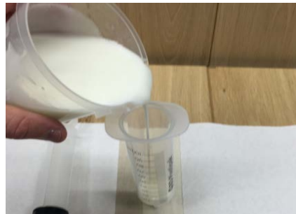
6. Insert syringe into the drill hole and fill mixture into the syringe